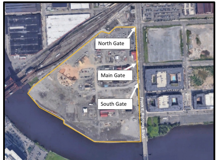
PSE&G Harrison Project Site